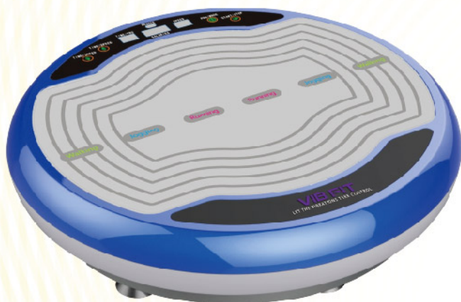
VP-12 200W, Oscillation, LED Touch screen+ Remote control, with 2 ropes, 590*590*150mm