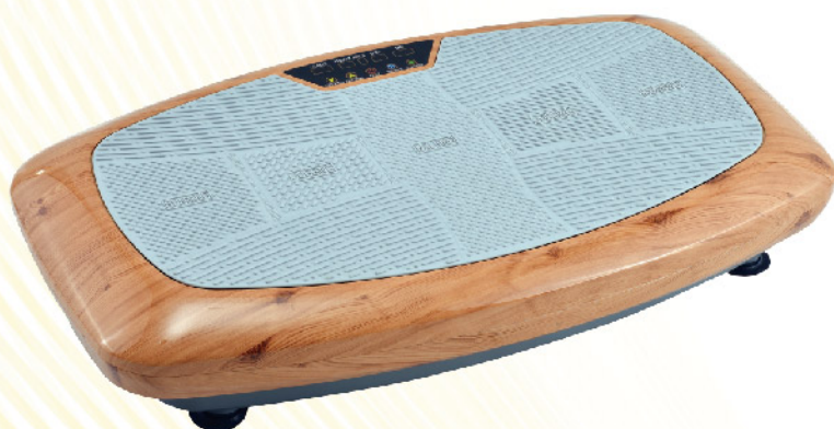
VP-01-W 200W, Oscillation, LED Touch screen+ Remote control, with 2 ropes, 760*435*147mm