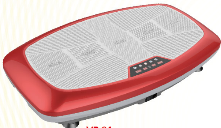
VP-01 200W, Oscillation, LED Touch screen+ Remote control, with 2 ropes, 760*435*147mm