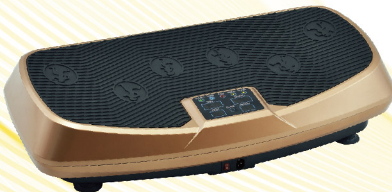
VP-18 200W, Oscillation, LED Touch screen+ Remote control, with 2 ropes, 750*440*180mm