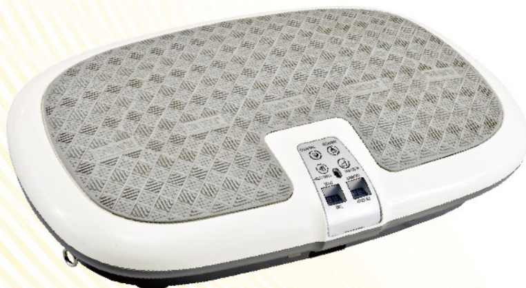
VP-15 200W, Oscillation, LED Touch screen+ Remote control, with 2 ropes, 650*410*130mm